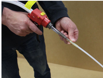
Step 8. For stand-up applications, users can elect to attach an extension tube to the mix tip. Simply, slide the extension tube over the end of the mix tip until it fits snugly. Ensure the extension tube is engaged with all 3 barbs of the mix tip.