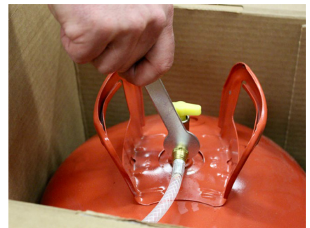
Step 6. Tighten both fittings with the 9/16-in. wrench (provided) by turning an additional \frac{1}{6} turn until firmly attached. DO NOT OVER-TIGHTEN! Close lid of each box to protect from sun, wind and dirt.