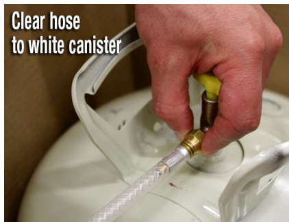
Step 5. Attach fitting on clear hose, finger tight, to the valve outlet of the white cylinder.