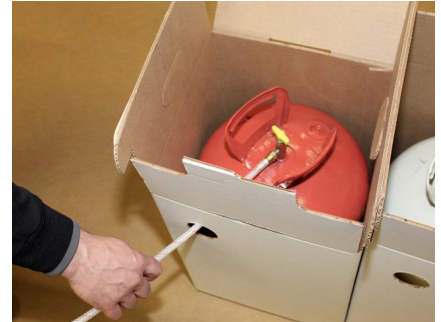
Step 3. Insert hoses through holes in side of carton.