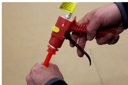
Step 7. Apply lubricant to black rubber o-ring. Insert gun into mix tip and then twist to "lock" it in place.