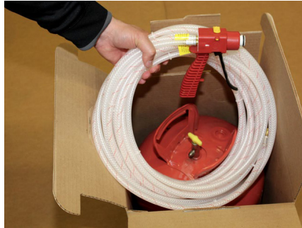
Step 1. Remove hose and applicator assembly from carton.

Please read and understand all instructions.