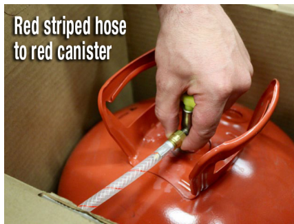
Step 4. Attach swivel fitting on red striped hose, finger tight, to the valve outlet on top of the red cylinder.