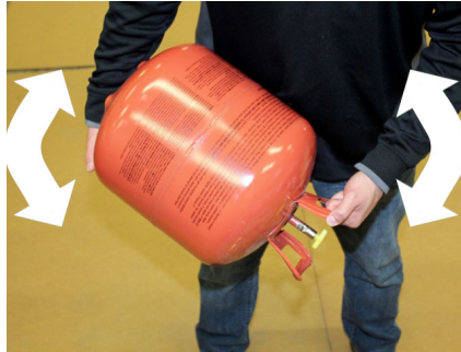
Step 2. Shake Canisters back and forth 30 times to get best mix. Replace canisters back in box.