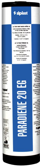
USES: BASE PLY FLASHING REINFORCING SHEET