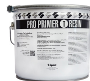
Pro Primer T or W depending in system