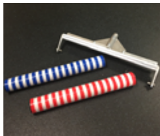
18" Pro Stub/Spike Frame

6" stub roller for stand-up application of VTS Resin/Filler. The roller segments are white and are manufactured from high density polyethylene while the end caps are made from ultra-high molecular weight polyethylene. Includes a frame. Replacement rollers are also available.