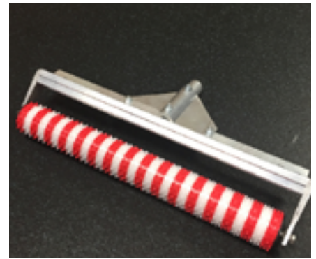
18" Pro Stub Roller – VTS

18" stub roller for application of the base coat of Terapro Base Resin and Parapro Roof Resin. The roller has alternating blue and white segments to differentiate it from the Pro Stub Roller VTS (red/white segments). The roller segments are manufactured from high density polyethylene while the end caps are made from ultra-high molecular weight polyethylene. Use with 18" Pro Spike and Stub Roller Frame (sold separately).