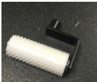
6" Pro Stub Roller – VTS

18" stub roller for stand-up application of VTS Resin/Filler. The roller has alternating red and white segments to differentiate it from the Pro Stub Roller – Base Coat (blue/white segments). The roller segments are manufactured from high density polyethylene while the end caps are made from ultra-high molecular weight polyethylene. Use with 18" Pro Spike and Stub Roller Frame (sold separately).