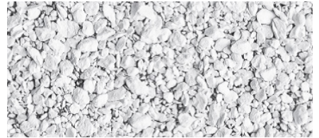
AW Arctic White