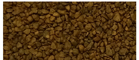
Cinnamon Brown A-556