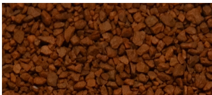
Spanish Tile Red A-201

Colors shown are for reference only and may differ from actual product. We recommend requesting physical samples from your Siplast representative before making a final selection.