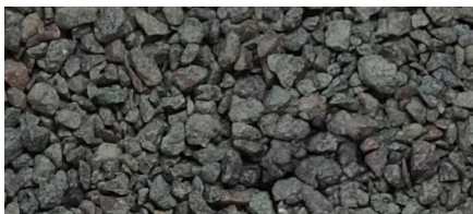
Light Gray A-116