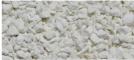
BW Bright White